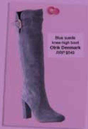
Blue suede knee-high boot Orlik Denmark RRP $242